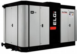
Oil-Free Series Screw 90 - 450 kW / 480 - 2515 cfm