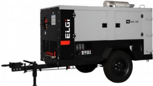
Diesel portable (Trolley) 185 - 1100 cfm / 100 - 300 psi