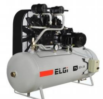
Oil-lubricated Recip 1.0 - 40 HP / 2.0 - 128 cfm