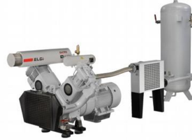
Oil-free Recip 1.0 - 75 HP / 1.8 - 300 cfm