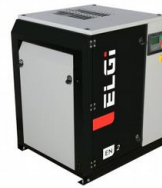
EN Series Rotary Screw 2.2 - 75 kW / 8.0 - 469 cfm