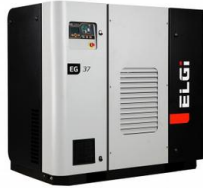
EG Series Rotary Screw 11 - 250 kW / 47 - 1612 cfm