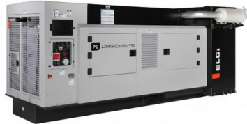
Diesel Portable (Skid) 475 - 1500 cfm / 150 - 400 psi