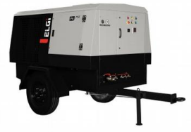
Electric Portable (Trolley) 22 - 75 kW / 131 - 490 cfm